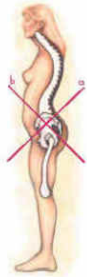
Lower Crossed Syndrome

Optimal stride length in pitching requires full hip flexor flexibility on the trail leg and full hamstring flexibility of the lead leg.